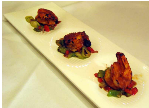
Mantra Three Shrimps