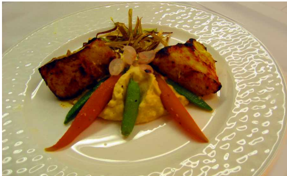
Mantra Kashmiri Cheyenne Pepper Sea Bass